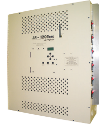
AR1202 Wall Mount Dimmer

Flexible, powerful, and affordable, this easy to install and use architectural system is equally at home in churches, schools, theaters, hotels, etc.