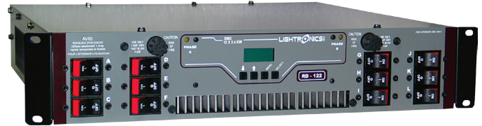
RD122 Rack Mount Dimmer

The RD122 is a 28,800 Watt, 12 channel, rack mount lighting dimmer. It is suitable for church, stage, theater, school, night club, live performances and other event and artistic applications. Each of the channels has a capacity of 2400 Watts. It is controlled via USITT DMX-512 low voltage signals. The unit is fan cooled. Channels may be independently assigned from the unit. The unit is over temperature and over voltage protected and has a magnetic circuit breaker for each channel. The RD122 has several stand alone functions which enable it to operate without a control console. These functions include a storable scene which may be activated by an external switch closure, a programmable chaser, and 7 factory set chase patterns.