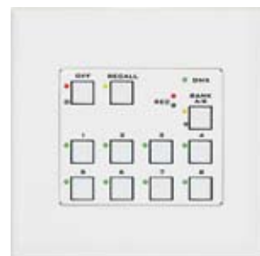
SR-516 DMX Scene Controller

The SR-516 is a theatrical / house light zone controller. The unit enables multi-location wall station control of any theatrical or architectural dimming system via standard DMX-512 placed in-line between dimmer and console. The unit communicates with remotes of several types and accommodates multiple mixed type remotes.